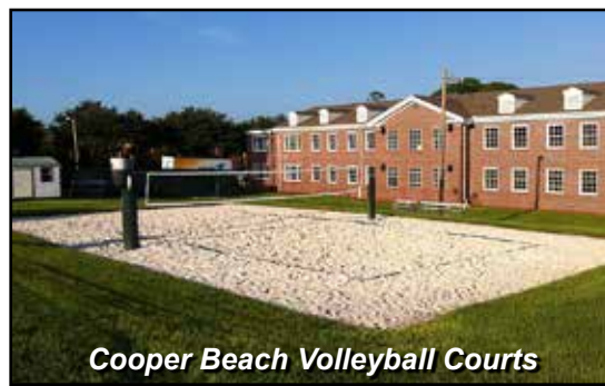
Cooper Beach Volleyball Courts