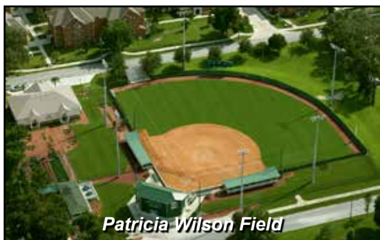
Patricia Wilson Field