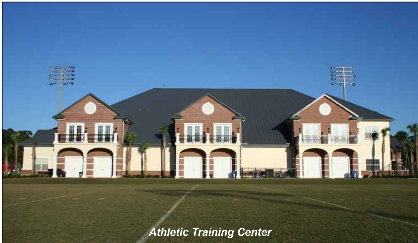
Athletic Training Center