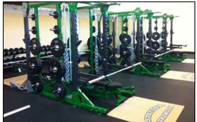
Stetson's Strength and Conditioning Facility at the Athletic Training Center